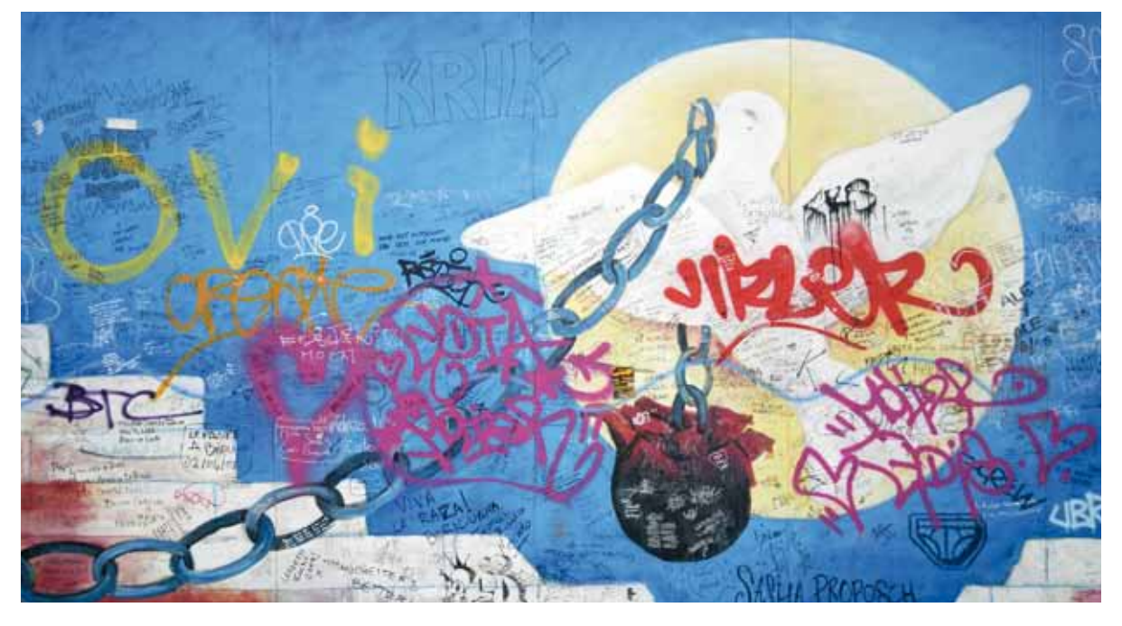
Graffiti at Berlin Wall – Peace is not a "surefire success". It is more than the absence of war. It needs people acting in concert and is interconnected to all realms of society

People in countries joining the EU believed one essential promise of the Union: European integration on the basis of solidarity, a Structural and Cohesion policy to reduce the econo-