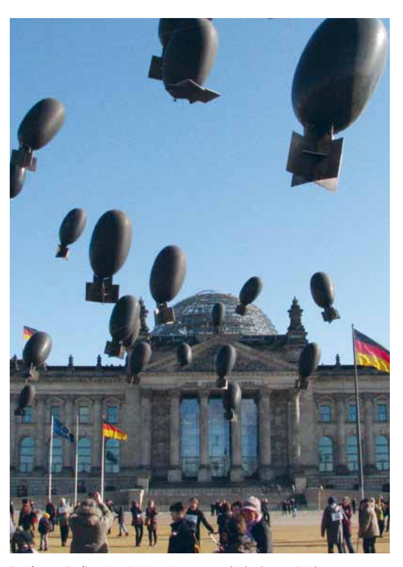
Bombs over Berlin - In an Action against armstrade the German Reichstag was covered in bomb shaped balloons

militarization not only touches on foreign affairs but goes right to the core of EU politics. Security politics, in the form of security research or border and crowd control, are at the center of a military logic for the inner politics of the EU. At the heart, and the gate opener for a military engagement within the borders of the EU, is the Lisbon Treaty's Solidarity Clause. With this clause the EU "and its Member States shall act jointly in a spirit of solidarity if a Member State is the object of a terrorist attack or the victim of a natural or man-made disaster." It enables the EU Council – if asked by an EU member state government - to send military troops to that country for protection of "democratic institutions and the civilian population". With the Solidarity Clause the EU can brace itself against acts of terrorism but also against upheaval, rebellion, and (violent) civil conflict in its member states. It begs the question: who, at the heart of the European Union, and with what legitimacy is making these decisions; and who is actually benefiting from these policies?